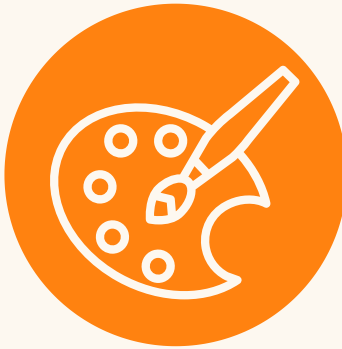
mba's spring art walk