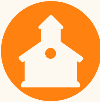
performances @ sanctuary