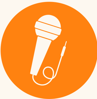
open mic @ serendipity