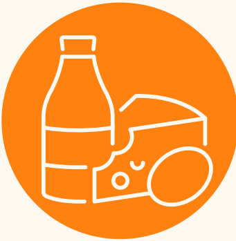
performances @ farmers' market