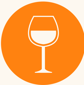
mba's sip and stroll