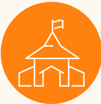
maynard fest performance