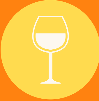
mba's sip and stroll